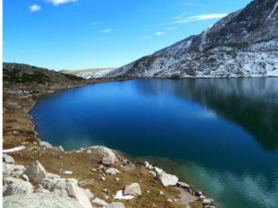
Ellen Steiner "Water and Sky"