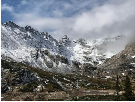
Anonymous "September Snow in Indian Peaks"